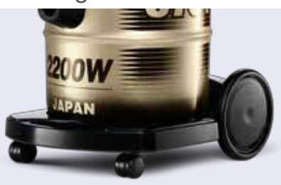
The tough base and large wheels assure extra light, smooth movement.

Tough Base<sup>n</sup> With Large Wheels